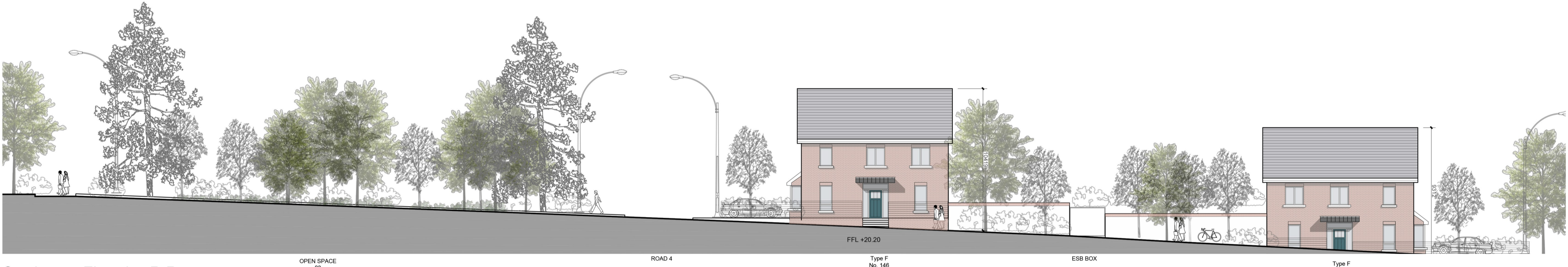
Contiguous Elevation R-R