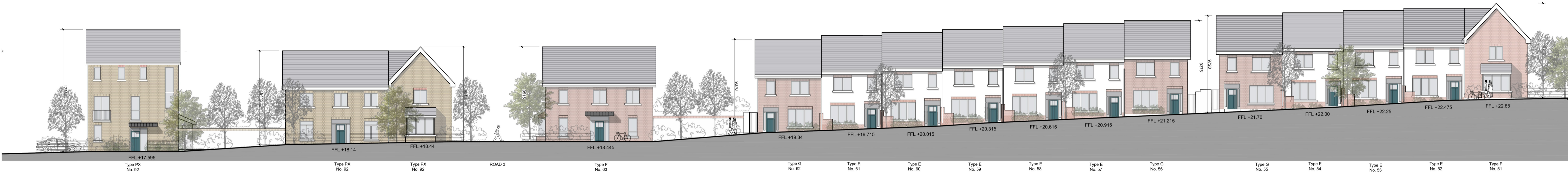
Contiguous Elevation S-S