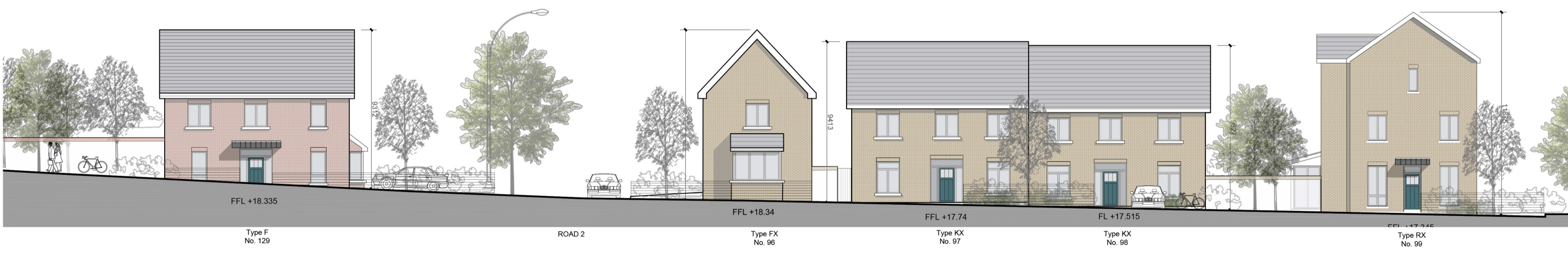
Contiguous Elevation R-R (Continued)